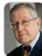
Klaus Regling Managing Director ESM

“The ESM and EFSF have played a key role in overcoming the crisis in the euro area. As the permanent crisis resolution mechanism, the ESM provides loans with long maturities at favourable rates to countries in need in exchange for policies to address their structural problems. The results are clear: with its banks on a sound footing, Spain exited successfully its recapitalisation programme at the end of 2013, followed by clean exits from Ireland and Portugal. Cyprus is also on a good path, making steady progress in correcting its imbalances. The ESM programme for Greece will help the country to carry out long-needed reforms. Our loans will ensure financing for the Greek government at conditions that give its budget flexibility, while also providing a buffer for the Greek banking sector. The crisis may now be less acute but the ESM will remain an active issuer in the market, backed by a strong capital structure of over €80 billion in paid-in capital.”