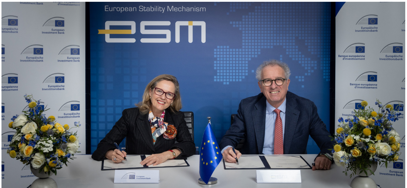
EIB Group President Nadia Calviño and ESM Managing Director Pierre Gramegna signed an MoU between both institutions

The Memorandum of Understanding enhances the existing collaboration between the ESM (and previously the EFSF) and the EIB, which was initially formalised through a Service Level Agreement in 2010 and further strengthened by a Cooperation Agreement in 2013. The MoU is signed for the initial period of five years, with a possibility for a further extension.