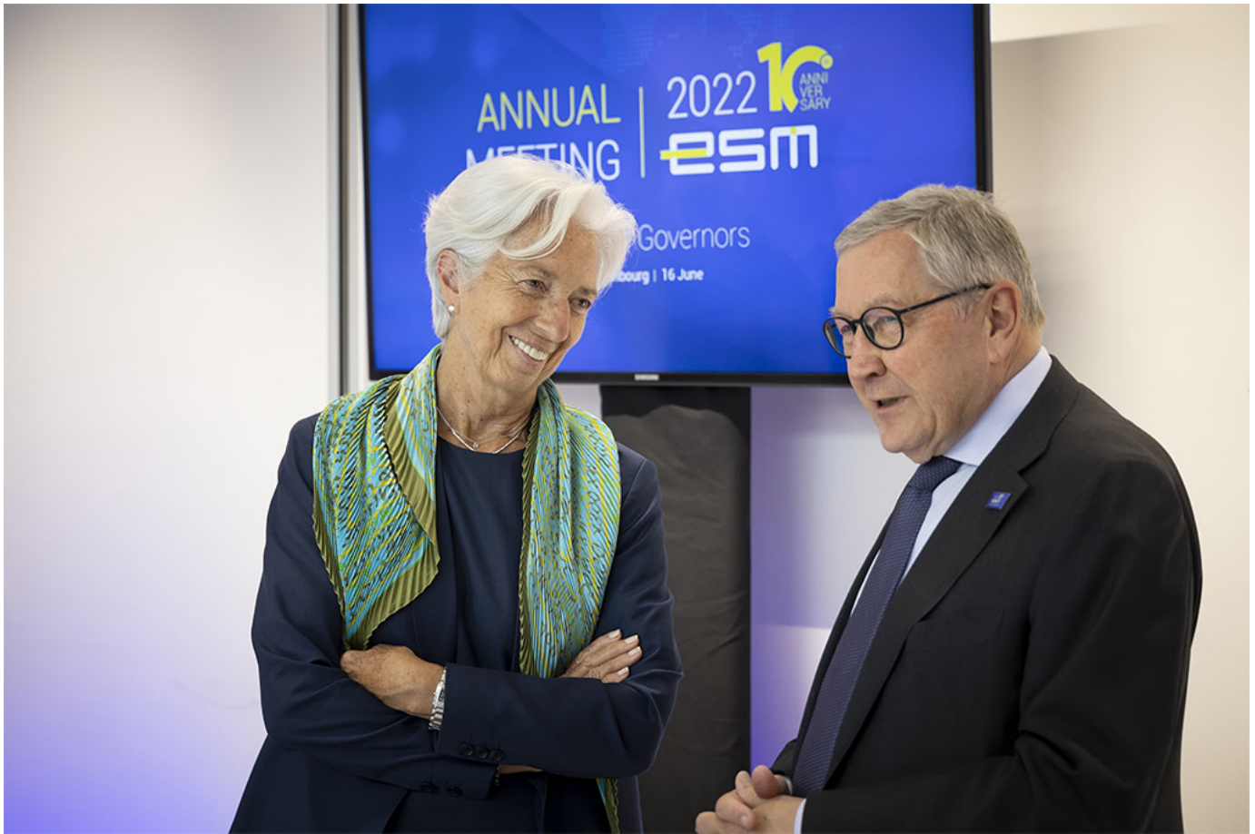
From left to right: Paschal DONOHOE (Eurogroup President, Ireland), Klaus REGLING (Managing Director, ESM)