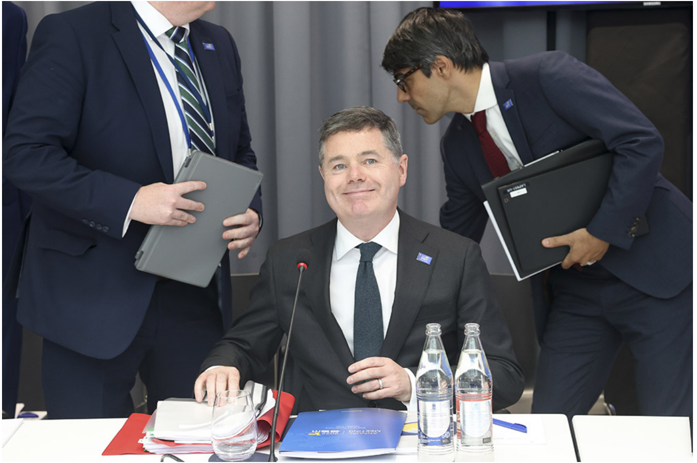
From left to right: Christos STAIKOURAS (Minister for Finance, Greece), Klaus REGLING (Managing Director, ESM)