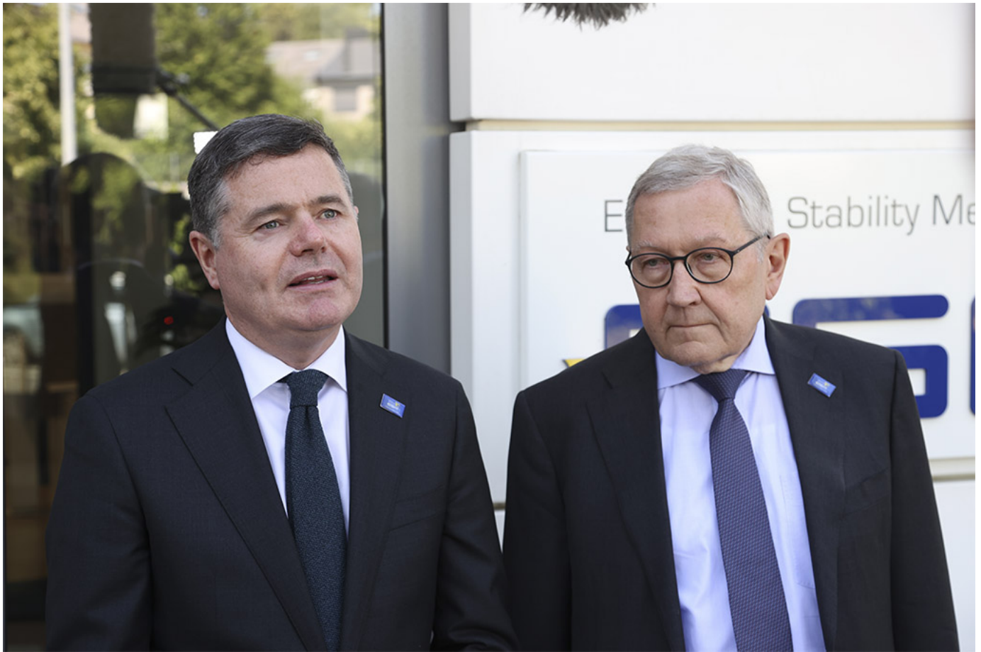
From left to right: Paolo GENTILONI (European Commissioner for Economy, EUROPEAN COMMISSION), Magnus BRUNNER (Federal Minister for Finance, Austria), Vincent VAN PETEGHEM (Deputy Prime Minister and Minister for Finance, Belgium)