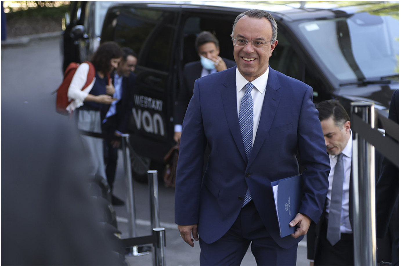
From left to right: Paschal DONOHOE (Eurogroup President, Ireland), Klaus REGLING (Managing Director, ESM)