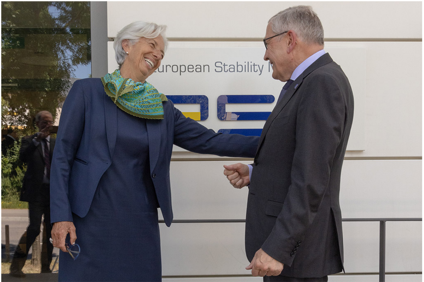
From left to right: Christine LAGARDE (President, European Central Bank), Klaus REGLING (Managing Director, ESM)