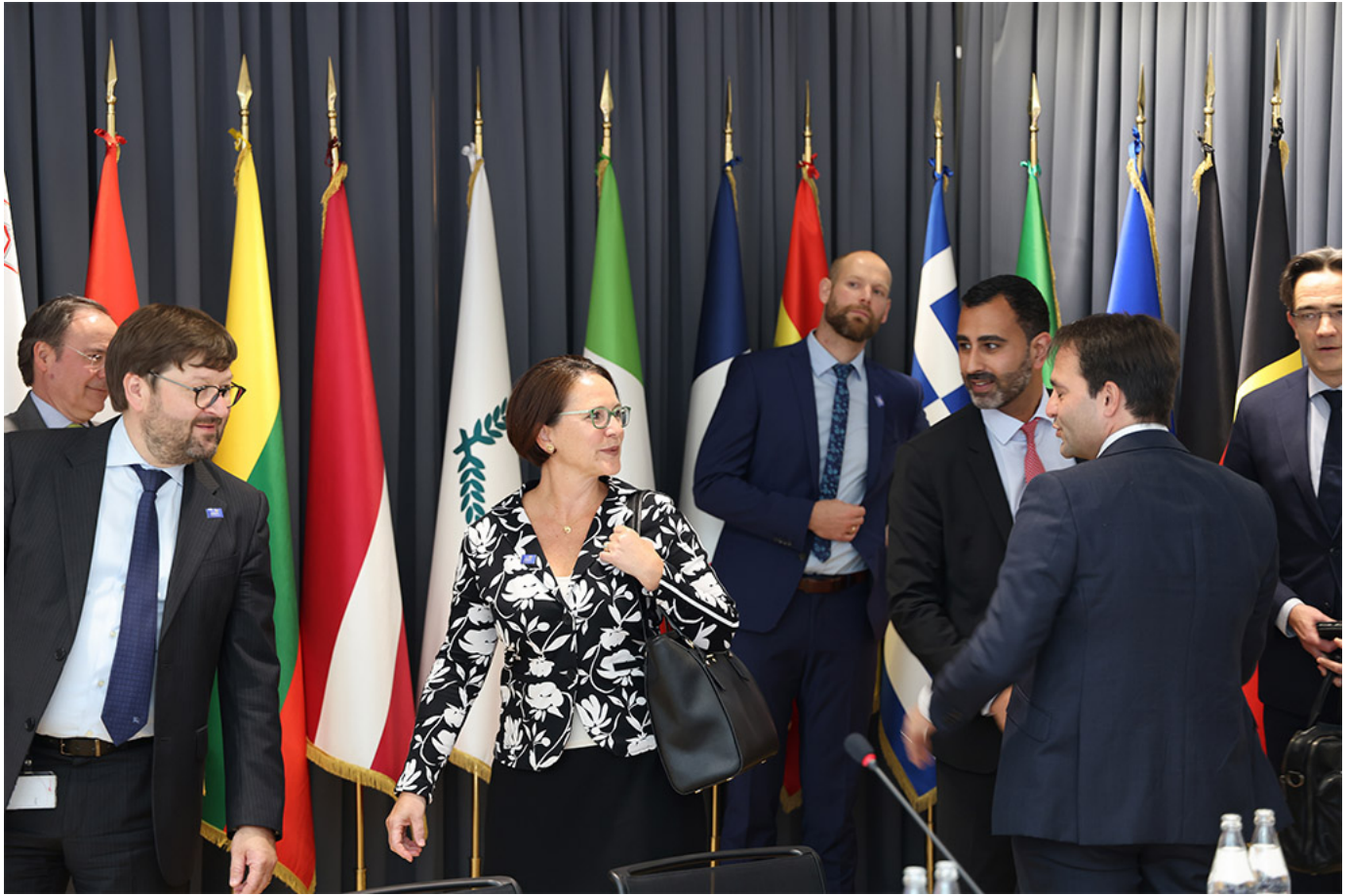
From left to right: Christos STAIKOURAS (Minister for Finance, Greece), Yuriko BACKES (Minister for Finance, Luxembourg)