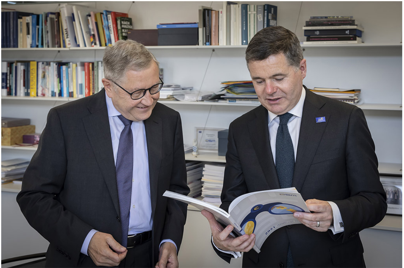
From left to right: Klaus REGLING (Managing Director, ESM), Paschal DONOHOE (Eurogroup President, Ireland)