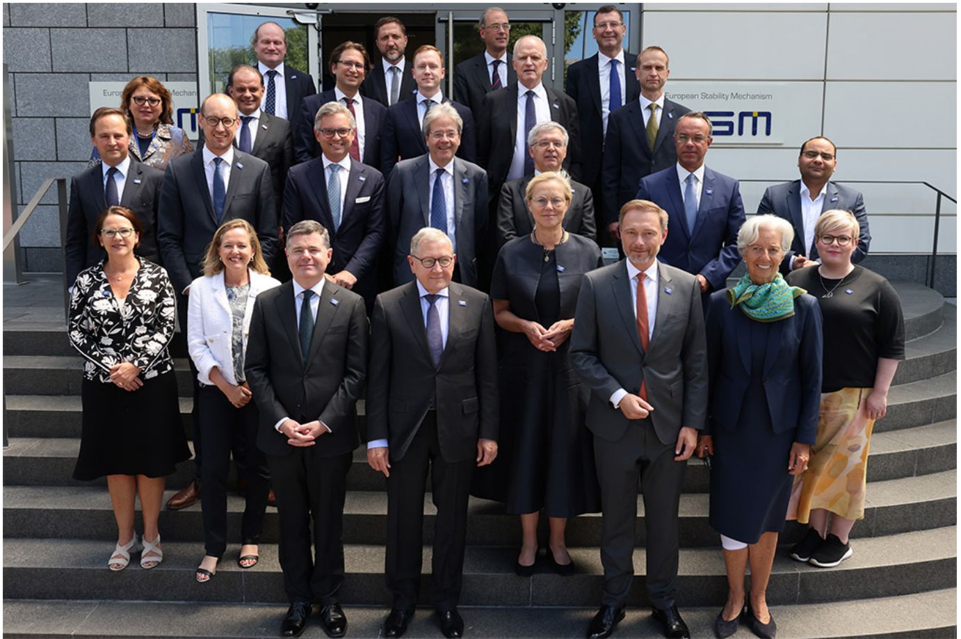
From left to right: Christine LAGARDE (President, European Central Bank), Klaus REGLING (Managing Director, ESM)