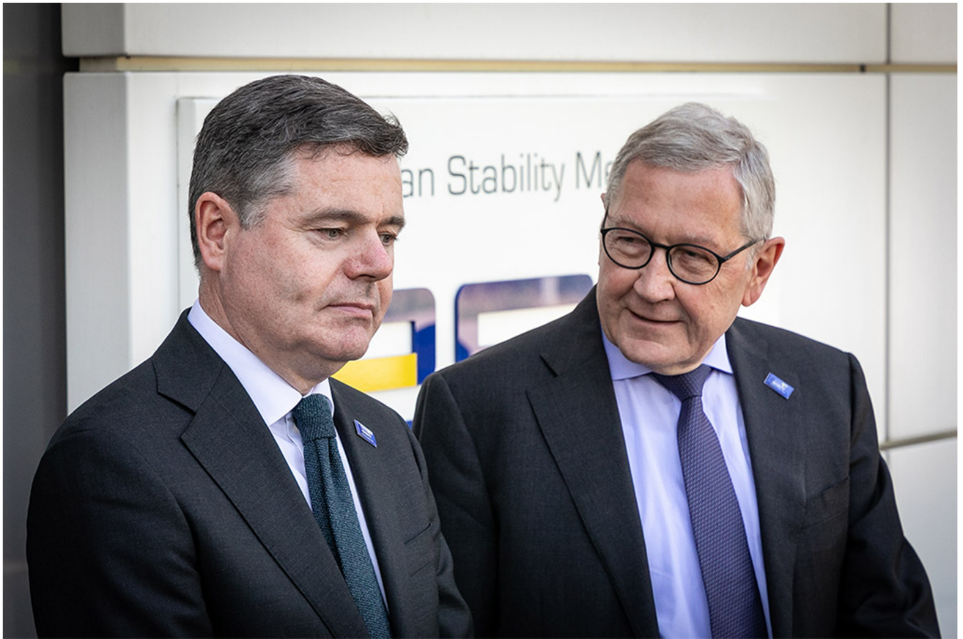
From left to right: Paschal DONOHOE (Eurogroup President, Ireland), Klaus REGLING (Managing Director, ESM)